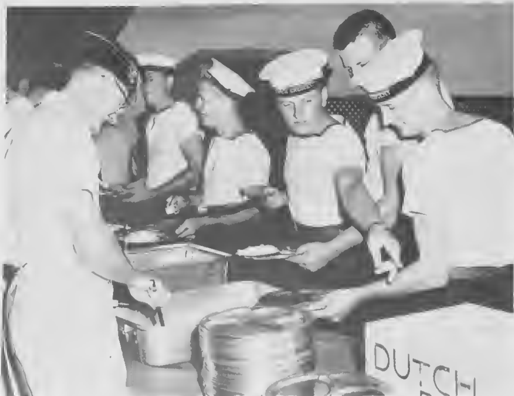
THE American Legion and Lago Community Council entertained the crews of both ships at a picnic....